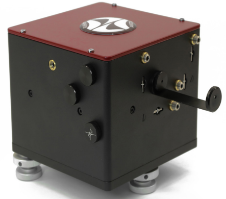
The AA-20DD optical unit